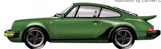
1988 Type 911 Carrera. Illustration by Carmen Console