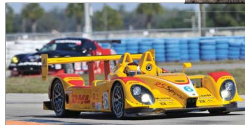
At Sebring in January of 2008 the Penske team's RS Spyder strutted its stuff in the ALMS practice session, showing that despite a weight penalty it still had the credentials to lead the field.